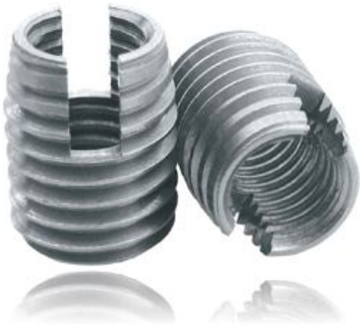
Stainless Steel 1.4105 Stainless Steel 1.4305